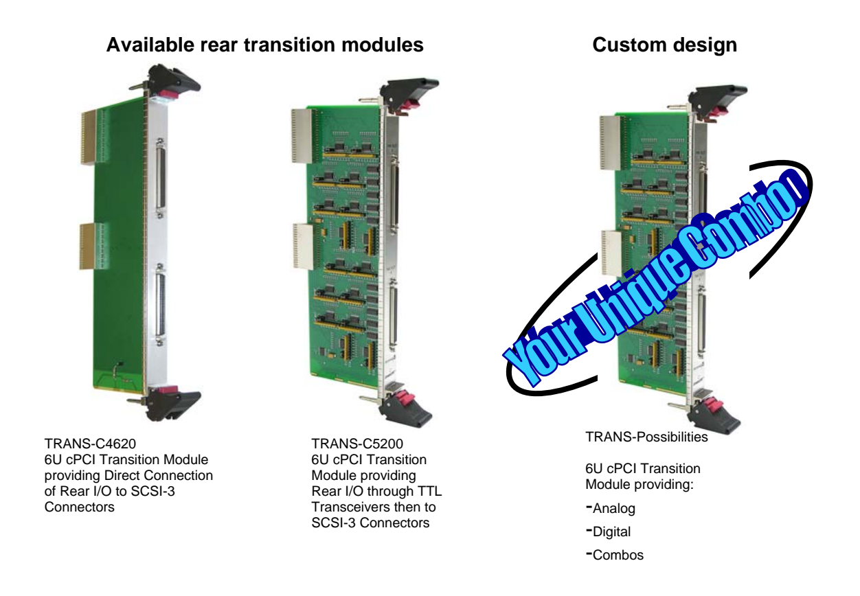
Figure 2: Acromag rear transition modules

Front I/O is accessible using the FPGA module's front panel mezzanine bus (see Figure 1). By simply attaching an Acromag extension module (AXM) to the front mezzanine connector (see Figure 3), the COTS FPGA module can now implement a variety of standard or custom I/O configurations. Standard AXM I/O modules include the AXM-D02 (RS485), AXM-D03 (CMOS & RS485), AXM-D04 (TTL & RS485), and the AXM-A30 (analog input).