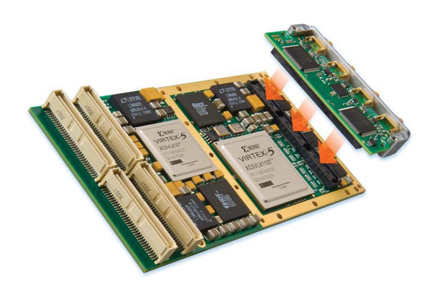
Figure 3: Connecting a front-panel I/O mezzanine module

Front I/O is accessible using the FPGA module's front panel mezzanine bus (see Figure 1). By simply attaching an Acromag extension module (AXM) to the front mezzanine connector (see Figure 3), the COTS FPGA module can now implement a variety of standard or custom I/O configurations. Standard AXM I/O modules include the AXM-D02 (RS485), AXM-D03 (CMOS & RS485), AXM-D04 (TTL & RS485), and the AXM-A30 (analog input).