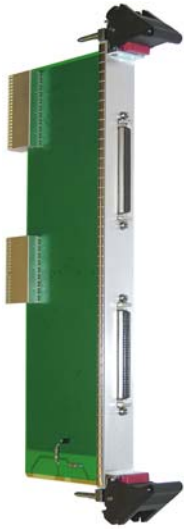
TRANS-C4620 6U cPCI Transition Module providing Direct Connection of Rear I/O to SCSI-3 Connectors