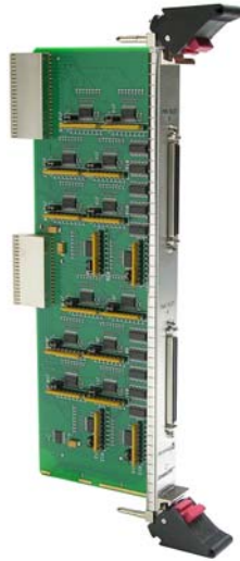
TRANS-C5200 6U cPCI Transition Module providing Rear I/O through TTL Transceivers then to SCSI-3 Connectors