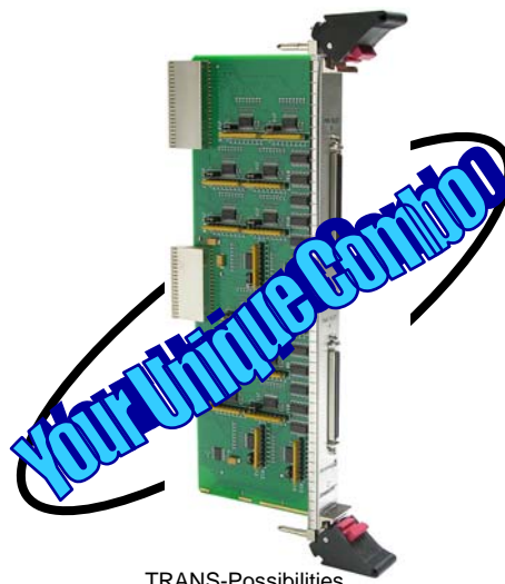
TRANS-Possibilities 6U cPCI Transition Module providing: -Analog -Digital -Combos

Front I/O is accessible using the FPGA module's front panel mezzanine bus (see Figure 1). By simply attaching an Acromag extension module (AXM) to the front mezzanine connector (see Figure 3), the COTS FPGA module can now implement a variety of standard or custom I/O configurations. Standard AXM I/O modules include the AXM-D02 (RS485), AXM-D03 (CMOS & RS485), AXM-D04 (TTL & RS485), and the AXM-A30 (analog input).