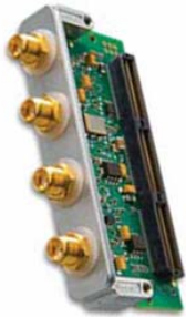
Analog Input: AXM-A30