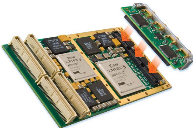
Figure 3: Connecting a front-panel I/O mezzanine module

Front I/O is accessible using the FPGA module's front panel mezzanine bus (see Figure 1). By simply attaching an Acromag extension module (AXM) to the front mezzanine connector (see Figure 3), the COTS FPGA module can now implement a variety of standard or custom I/O configurations. Standard AXM I/O modules include the AXM-D02 (RS485), AXM-D03 (CMOS & RS485), AXM-D04 (TTL & RS485), and the AXM-A30 (analog input).