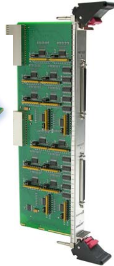
TRANS-C5200 6U cPCI Transition Module providing Rear I/O through TTL Transceivers then to SCSI-3 Connectors

It is now common to deploy COTS FPGA modules to help speed development cycles and reduce overall project costs. However, to maximize savings when FPGAs are used to perform custom I/O functions, it is very important to first determine the suitability of a particular FPGA module for the application. This determination is dependent upon several factors: