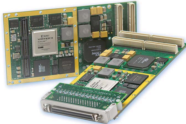
CMOS & RS485 I/O: AXM-D03